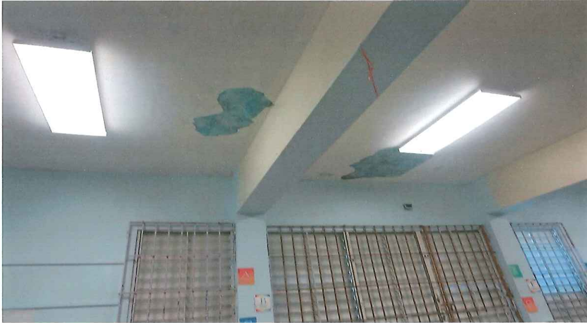
Empañetado brotado del techo