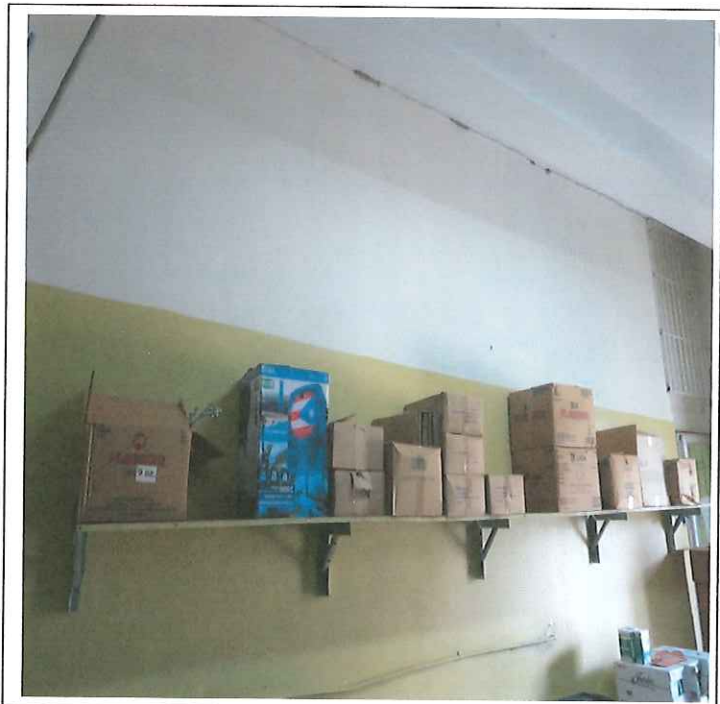
Grieta demarcando pared entre el Comedor y Almacén