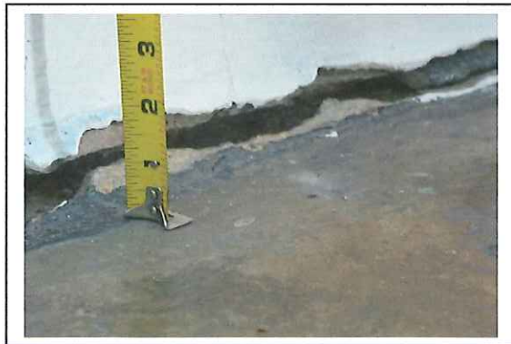
Asentamiento de Piso